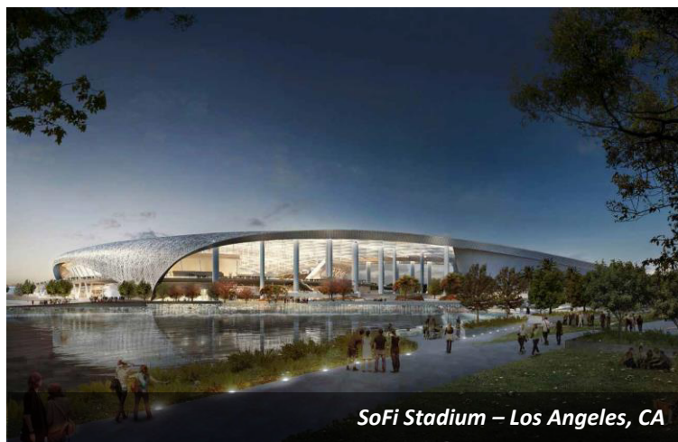
SoFi Stadium – Los Angeles, CA

HKS is a global firm of architects, designers, advisors whose work combines beauty with performance. With a staff of 1,350 people in 23 locations, they are united by their shared culture and sense of purpose. Their properties include AT&T Stadium (home to the Dallas Cowboys), which was named “Facility of the Decade” by Sports Business Journal, SoFi Stadium in Los Angeles (home to the NFL Rams and Chargers), the Grand Hyatt Nashville, and the Infinity Casino and Resort in the Philippines. They also were the lead architect on the MGM National Harbor casino.