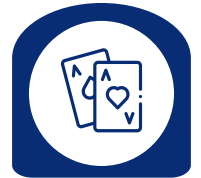
Table games, spa, sports book, restaurants, bars and shows

We need you to help bring this exciting destination to Norfolk. VOTE YES ON THE REFERENDUM ON NOVEMBER 3RD! Go to ALLINNORFOLK.COM to learn more and get involved!